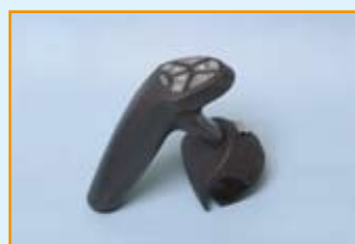
SmartSteer with adapter