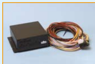
CAN-Bus / Multiplex

This version is suitable for conventional cars (high power). It has the same advantages as both the other SmartControl version, but has a power relay board instead of a signal relay board.